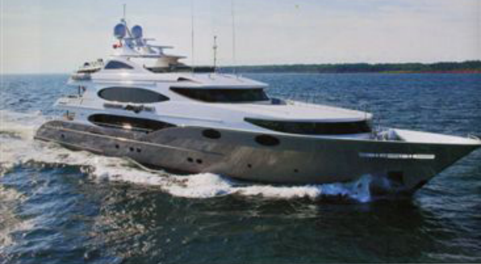
She is a tri-deck with a beam of 28 ft. (8.6m) and an aluminum semi-displacement hull and aluminum superstructure. The propulsion system from two Caterpillar engines 3512E, producing 2200hp. This provides a top speed of approximately 20 knots. She has a cruising range of 3000 nautical miles at 10 knots. The Destination FORTHABER 100 has an advanced stabilizing system featuring Quantum 2s active fin with digital controls with Zero Speed™. The yacht has a Quantum 150hp bow thruster.